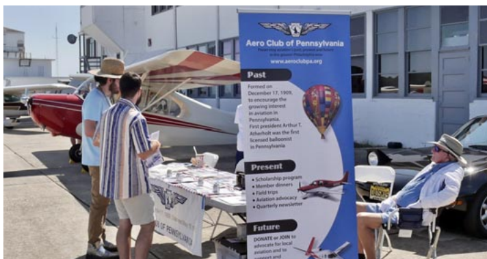
Aero Club display at Cape May