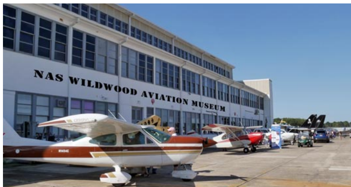
Flight line at Cape May