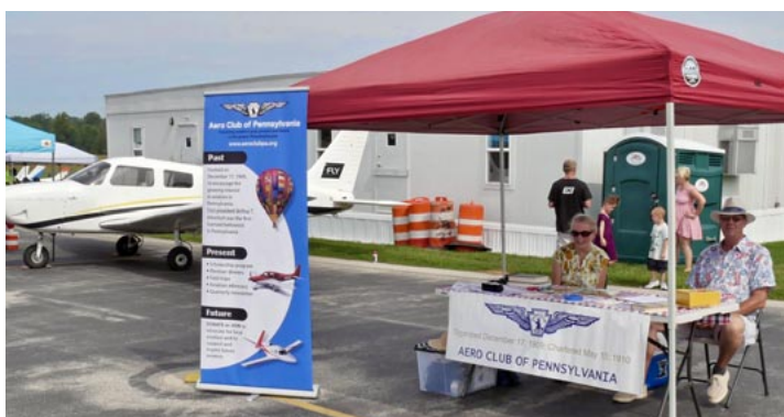
Aero Club display at Wings Field