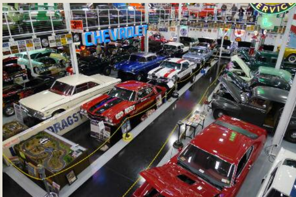
Auto Museum at Eagles Mere