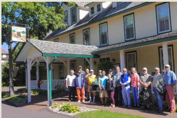
Aero Club members at Eagles Mere Inn