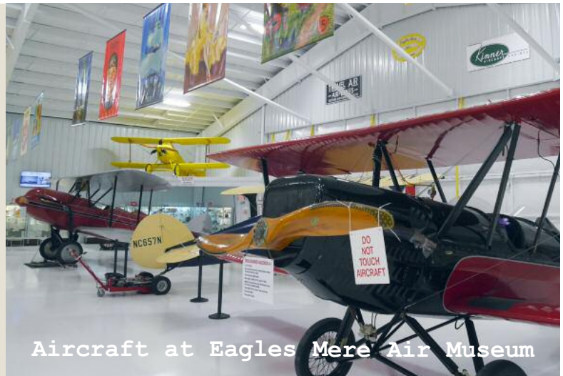
Aircraft at Eagles Mere Air Museum

16 Aero Club members flew in seven aircraft into the Eagles Mere Air Museum in northern Pennsylvania on September 24. Weather in the Philadelphia area kept some aircraft on the ground, but for those who managed to make it, weather was quite pleasant in northern Pennsylvania. The group was ferried by the museum staff into town for a buffet lunch provided by the Eagles Mere Inn. Returning to the airport, guests visited the many aircraft displays and car museum. This private airport and museum is open to the public on weekends from late May until early October.