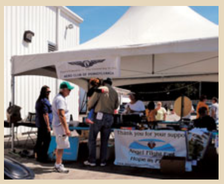
Annual Aero Club Fly Market at Wings Airfield.