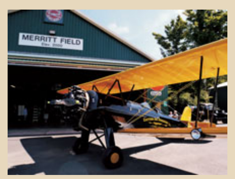
Pitcairn Mailwing at Eagles Mere Aviation Museum.