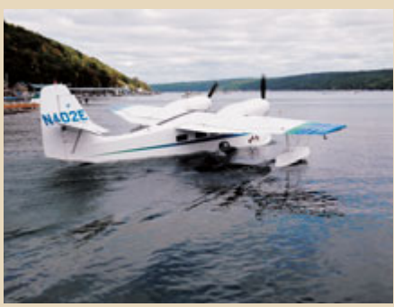
Grumman Super Widgeon on Keuka Lake, Hammondsport, NY.