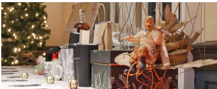
Silent Auction table

For 2023, we will accept donations all year round and we can pick up items. Items do not have to be aviation-related, although aviation-themed is always great! If you are interested in donating, please contact me at sarah-wolfe@windstream.net. See you next year!