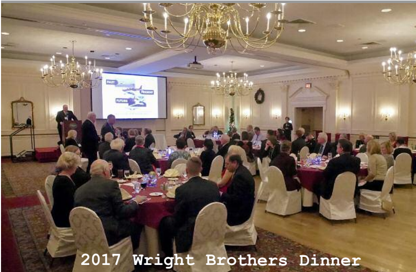
2017 Wright Brothers Dinner