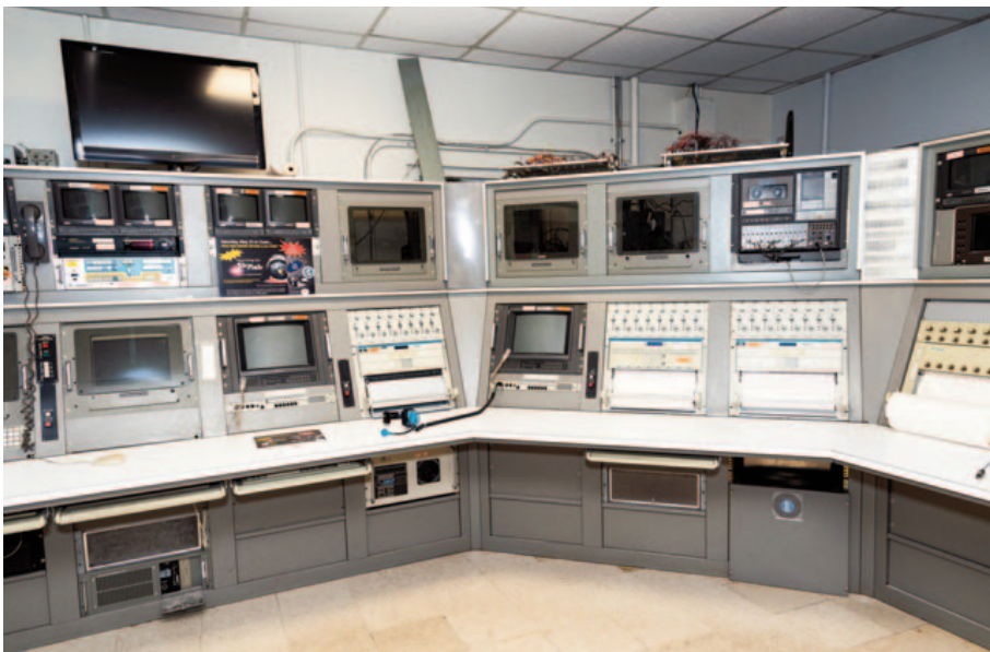
Centrifuge control center