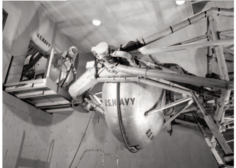
Astronaut Wally Schirra boarding original centrifuge

The facility is open for tours and has three large spaces available for events. See rentthefuge.com .