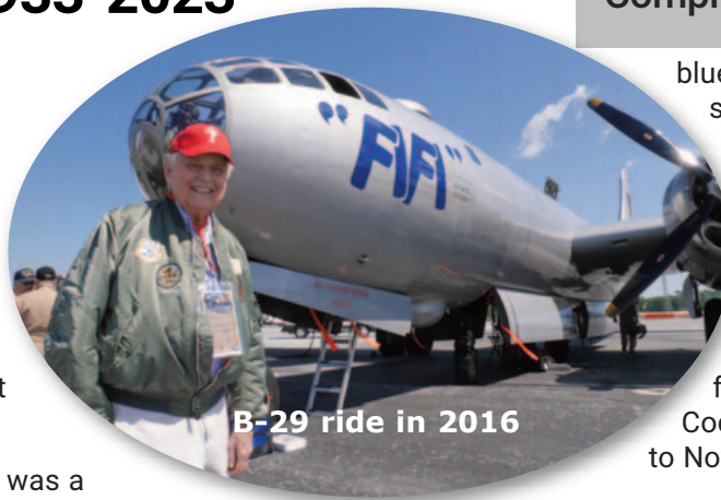
B-29 ride in 2016