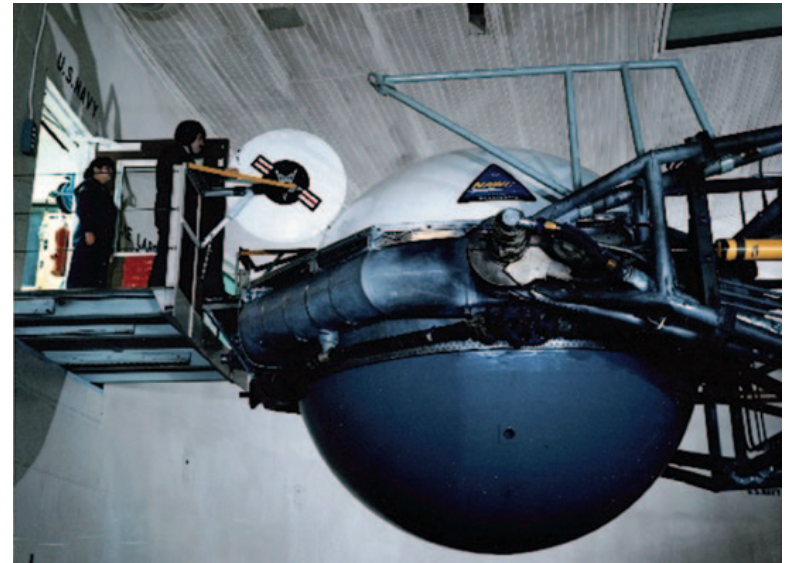
Current-day spheroid gondola