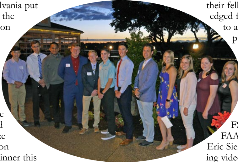
2019 Scholarship Recipients

The Aero Club of Pennsylvania put on a wonderful evening at the annual scholarship dinner on June 13th at Wings Field. This year, 70 members, guests and awardees attended the dinner. $28,500 in Aero Club scholarships was awarded for various levels of flight and mechanic training. The Ninety-Nines also awarded $7,000. A time to recognize future leaders in the aviation industry, the scholarship dinner this year also gave up-and-coming aviators the rare chance to see one of