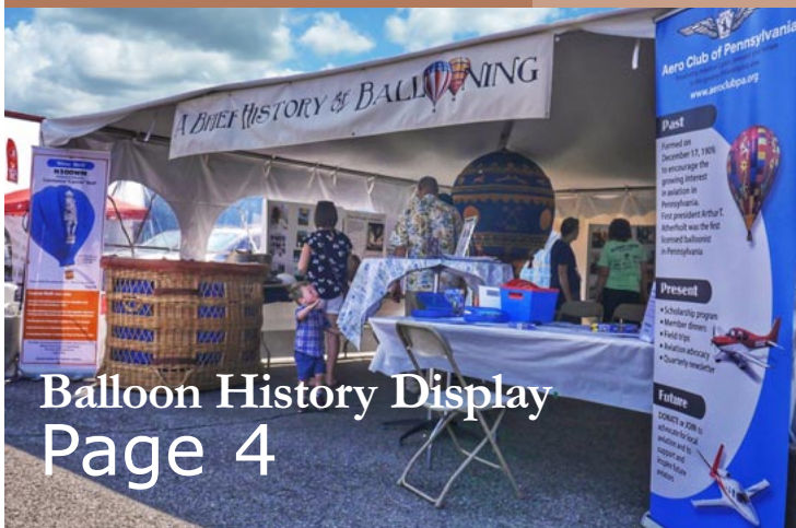
Balloon History Display Page 4