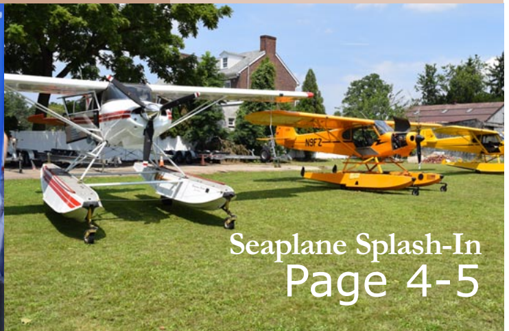
Seaplane Splash-In Page 4-5