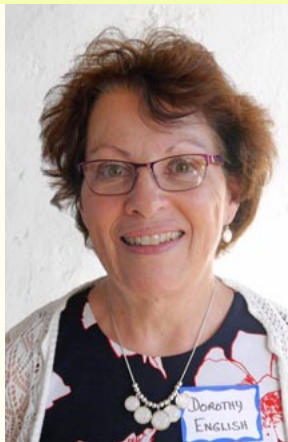
DOROTHY ENGLISH CONNIE WOLF AWARD

The Ninety-Nines awards scholarships to women to foster their interest in aviation. In 2018, they awarded $11,500 .