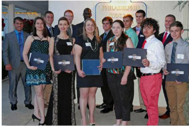
2017 Scholarship Recipients

On June 15, the Aero Club held its annual scholarship dinner at the Philadelphia Aviation Country Club at Wings Field. Awards were given by the Aero Club, the Eastern PA Chapter of the Ninety-Nines, and the Chester County Pilots Association. Over 70 members, recipients and family members attended the ceremony. The Aero Club of Pennsylvania Memorial Scholarship Fund awarded $42,500 in scholarships to 15 recipients, including $10,000 from