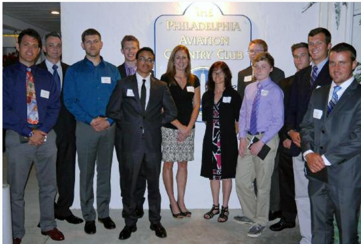
2016 Scholarship Recipients

On June 16, the Aero Club held its annual scholarship dinner at the Philadelphia Aviation Country Club at Wings Field. Eighty Aero Club and Ninety Nines members, recipients and family members attended the ceremony at Wings. The Aero Club of Pennsylvania Memorial Scholarship Fund awarded $40,000 in scholarships to 14 young men and women from the Philadelphia area. That amount includes $7,000 from the Chester County Airport Pilots and Tenants Association who raised money at their annual Fall Festival at Chester County Airport. Those recipients will train at Chester County Aviation. The Eastern Pennsylvania Chapter of the Ninety-Nines