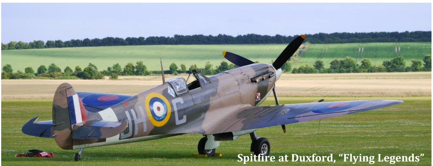
Spitfire at Duxford, "Flying Legends"

We hope to have a larger contingent next year. See you in 2017!