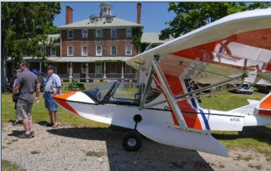
Seaplane at Tinicum

Five flying boats lined both sides of the freshly mowed grass at the historic 1799 Lazaretto house. We fired up two grills and fed the approximate 75 visitors with burgers, dogs