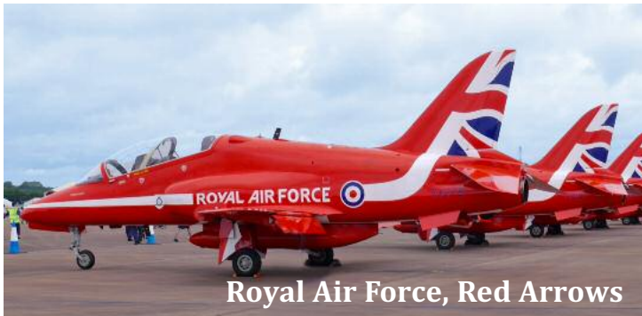
Royal Air Force, Red Arrows

A small group of ACPA members attended the Royal International Air Tattoo (RIAT) airshow at RAF Fairford on Friday July 8th for an airshow of mostly military airplanes. Some lively winds and occasional low ceilings prevented the warbirds from flying, but the jet aircraft put on a good show. I arrived with Mike Dunleavy via train from central London and then a bus ride through the English countryside to the airport. We