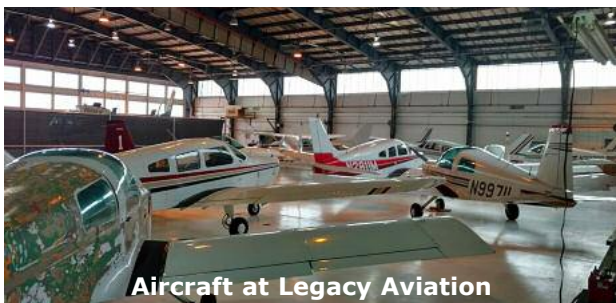
Aircraft at Legacy Aviation