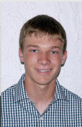
TERRY HATCHER AWARD