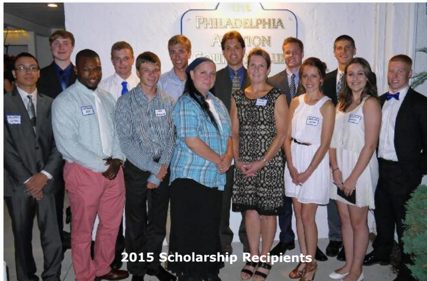
2015 Scholarship Recipients