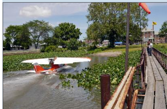
Trying the gravel ramp

A Searey from Ocean City, New Jersey was the first to try the newly smoothed gravel ramp and to be the first seaplane to arrive on Essington soil for many years. In the last decade, the ramp was in disrepair