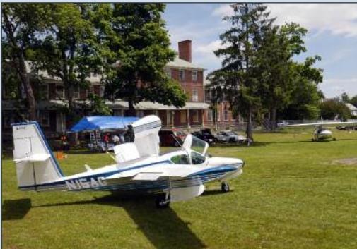
Seaplanes at the Lazaretto

The local township now holds the seaplane base license, as well as the land and the historic 1799 Lazaretto Quarantine Station that dates to the time of Yellow Fever.