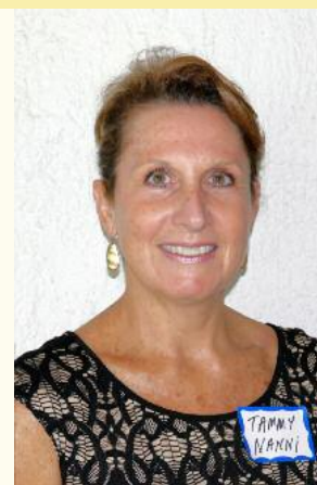
TAMMI NANNI THERESA DELLAQUILA AWARD