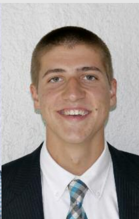
GEORGE WATSON AWARD