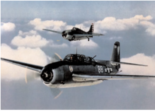
TBM flown by Al Sheves and FM-2 flown by Lex DuPont