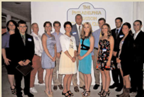
2014 Scholarship Recipients

On June 19, the Aero Club of Pennsylvania Memorial Scholarship Fund awarded $36,500 in aviation scholarship awards to 13 young men and women from the Philadelphia area. The annual scholarship dinner is held at the Philadelphia Aviation Country Club at Wings Field in Blue Bell, PA. The Eastern Pennsylvania Chapter of The Ninety-Nines also awarded $9000 in scholarships to five women at the dinner. 75 members, recipients and family members attended the ceremony.